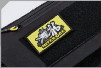
Frontal Loop Surface