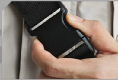
Shoulder Strap Buckle Ideal for quick detachment