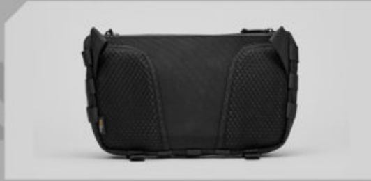
3D Breathable Design: For cushioning and pressure relief Sturdy Back Structure: Keeps its shape even when empty