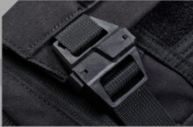
Durable High Quality Buckles